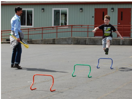
Astor students train for track meets!